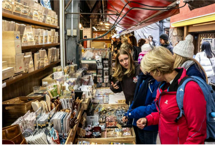
The economic benefits of tourism are clear.

The economic benefits are clear, however, with experts noting that tourism is now second only to vehicle exports in terms of earnings.