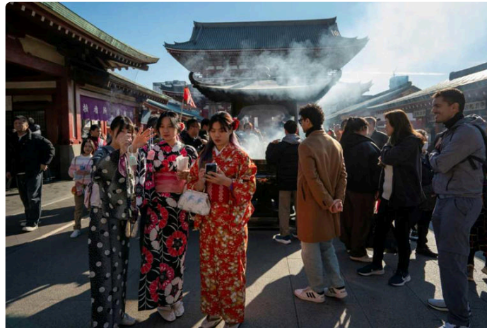
Japan aims to attract a yearly 60 million tourists by 2030.

Record numbers of tourists flocked to Japan last year, figures showed Wednesday, as the weak yen bolstered the appeal of the "bucket list" destination despite overcrowding complaints in hotspots like Kyoto.