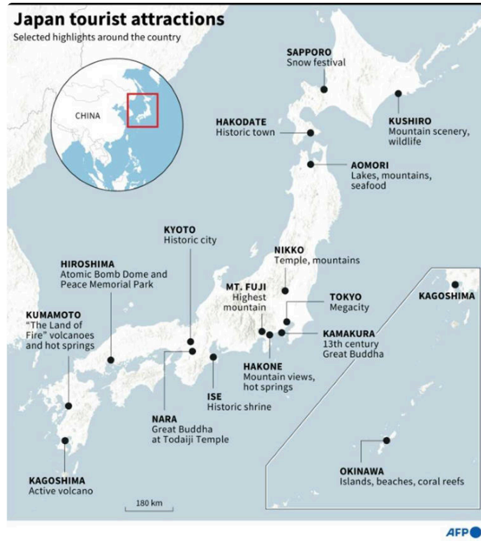
Japan has long been a 'bucket list' destination for many people.

Authorities say they want to spread sightseers more evenly around the country, and to avoid a bottleneck of visitors eager to snap spring cherry blossoms or vivid autumn colours.