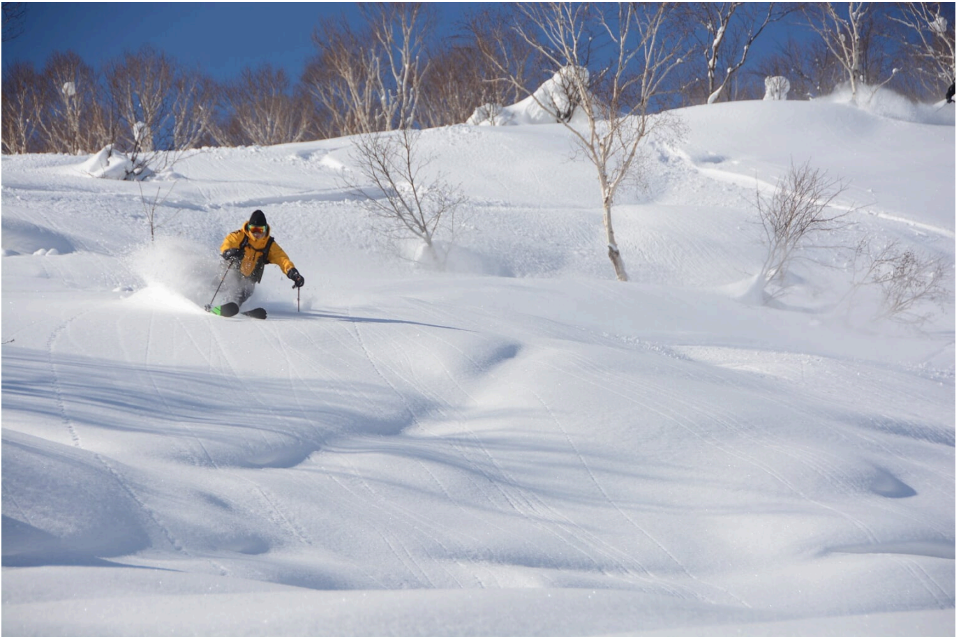
SECRET SNOWBOARD COURSES IN KUTCHAN, HOKKAIDO